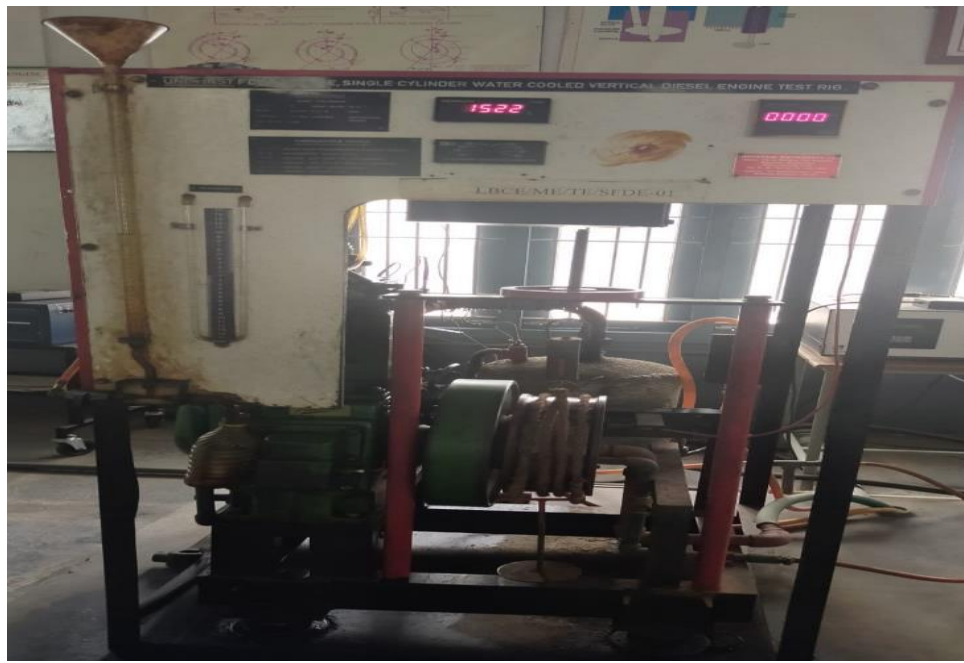
Fig.4 Four stroke single cylinder water cooled diesel engine