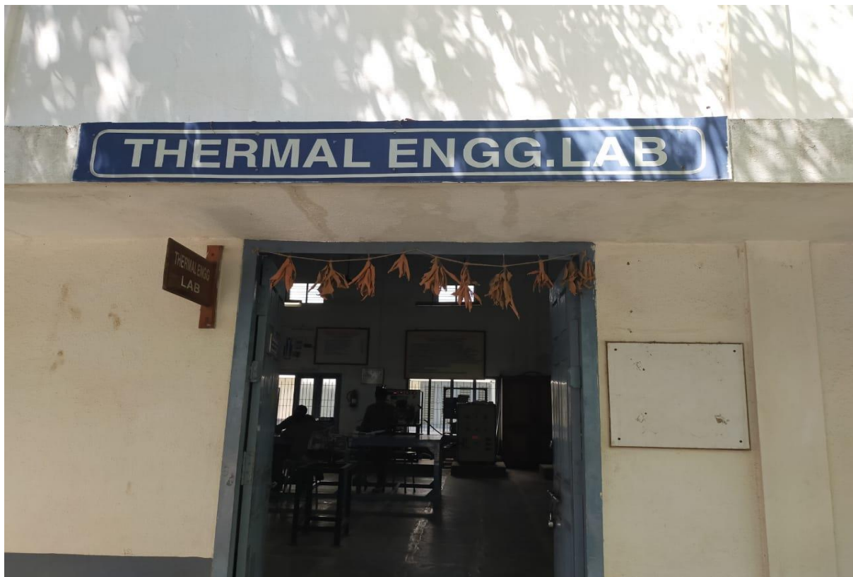
Fig.1 Thermal Engineering Lab