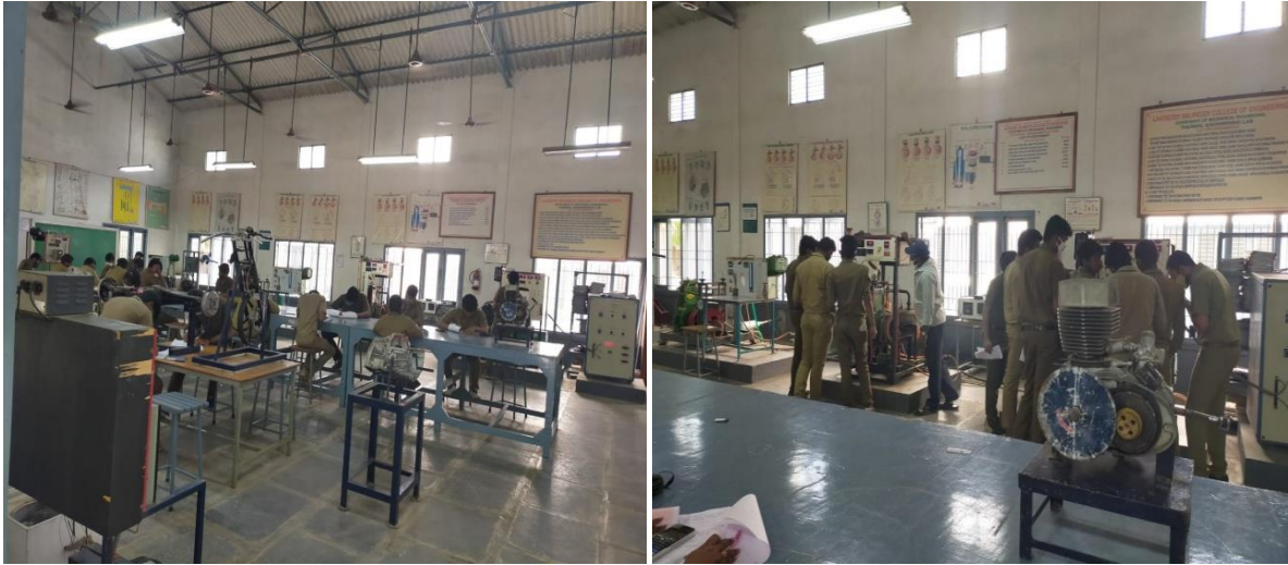
Fig.2 Thermal Engineering Lab overview