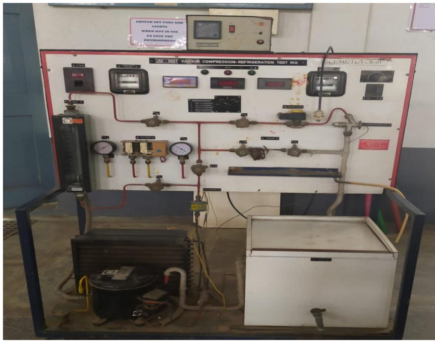
Fig.10 Vapour compression refrigeration system