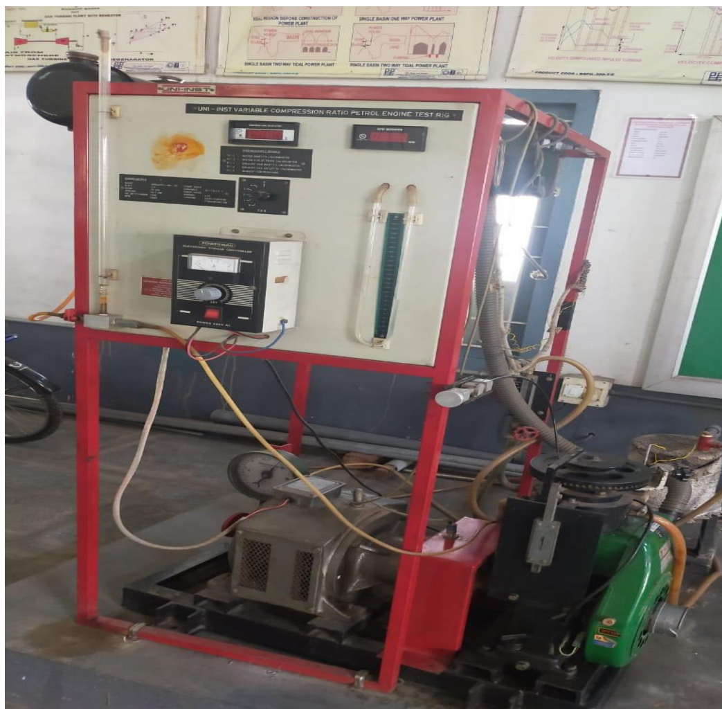
Fig.5 Four stroke single cylinder water cooled variable compression ratio petrol engine