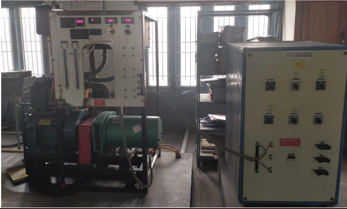
Fig.6 Four stroke twin cylinder water cooled diesel engine electrical rheostat loading