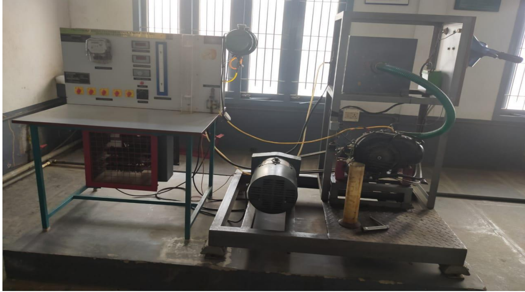
Fig.8 Single cylinder 2 stroke air cooled petrol engine

Diameter of LP Cylinder : 0.063 m Stroke of LP Cylinder : 0.087 m Diameter of orifice : 0.01 m