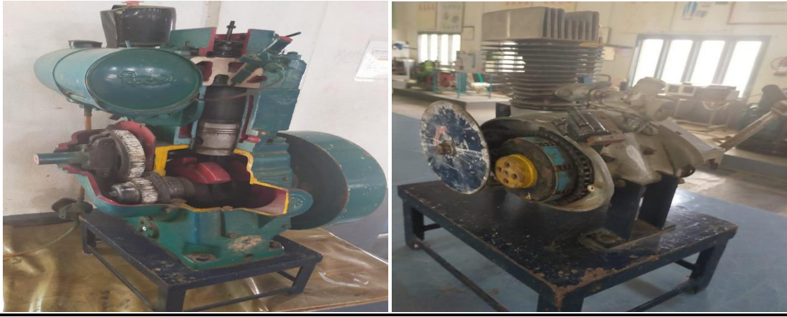
Fig.11 Valve timing diagram for 4 stroke diesel engine and Port timing diagram for 2 stroke petrol engine