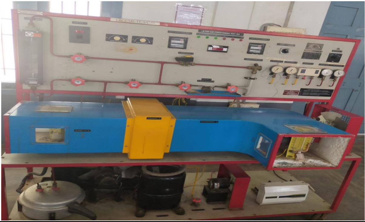
Fig.9 Air Conditioning Apparatus